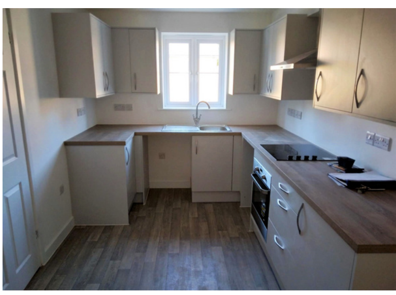
2-bedroom house, kitchen/diner