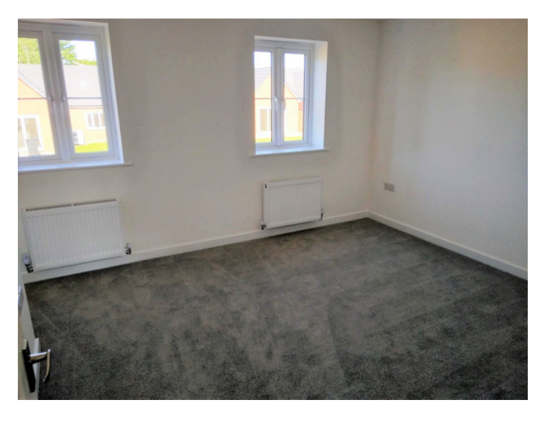
2-bedroom house, bedroom one