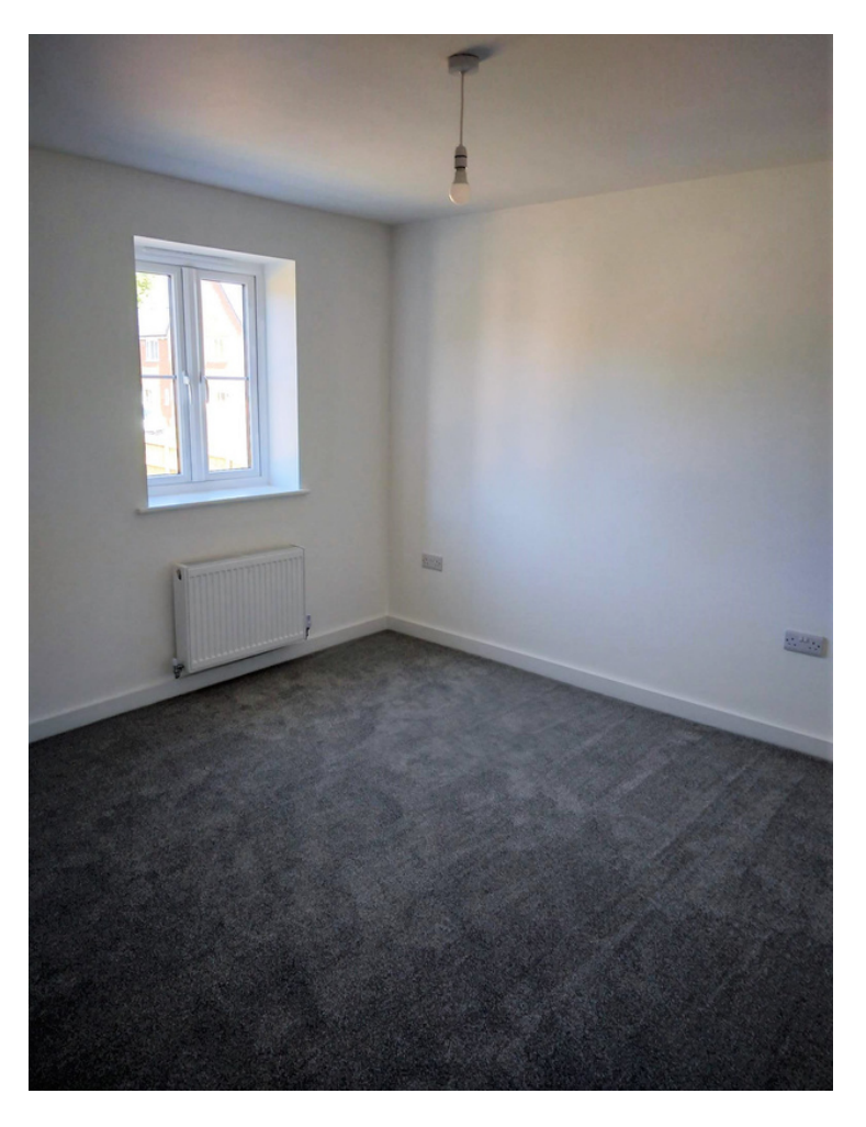
3-bedroom house, bedroom one