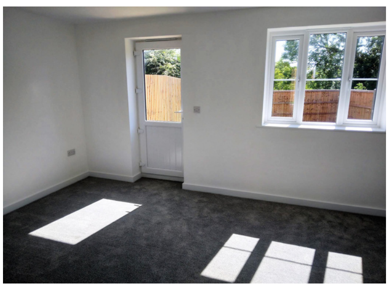
2-bedroom house, lounge