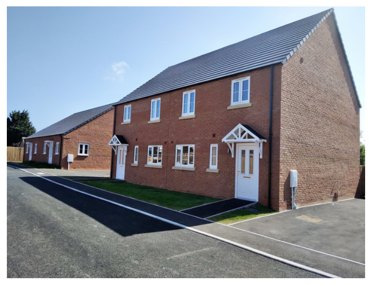
3-bedroom house, front

www.northamptonshirerha.org.uk/Howards-Way