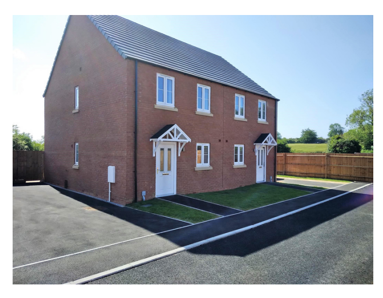
2-bedroom house, front