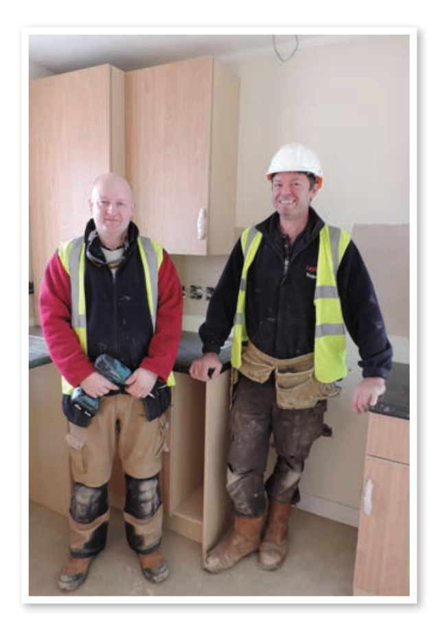
We also pride ourselves on providing a high quality housing management service to tenants that is sensitive to their needs.

Partnership working is crucial to increasing the supply of affordable homes, and has been the key to our success. We work closely with village communities, parish councils, local authorities, developers, landowners and government organisations such as the Homes and Communities Agency (HCA) to deliver bespoke rural housing solutions.